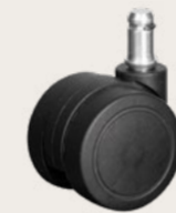
50mm Self Braking Nylon Castors