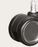
60mm Chrome Trim Castors With Noise Mute