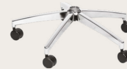
5-Star Chrome Spider Base - 60mm Castors