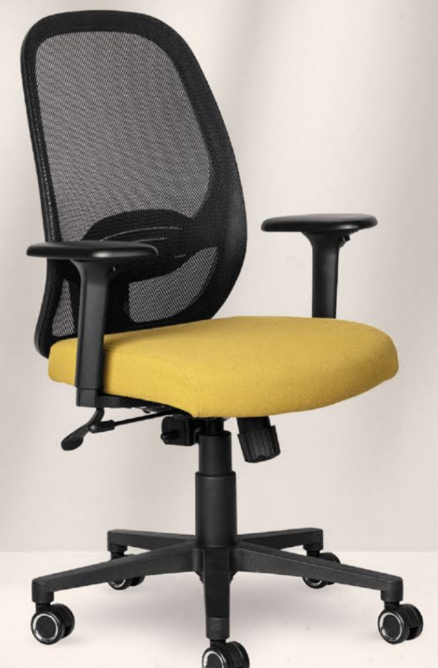
Evo Up-Spec New Cushy 2-D Arms with PU Armpads Chrome Trim Castors - 60mm Moulded Foam Seat