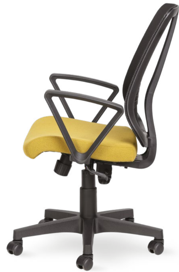
TRIO ARMS - Price Reduction