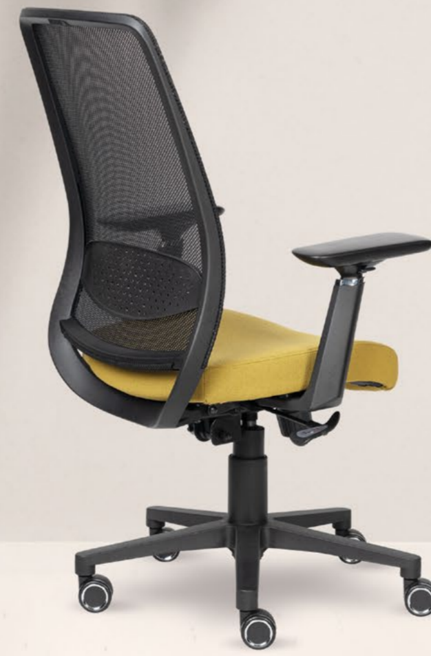
In-Line Up-Spec 3-D Arms with Chrome Trim + PU Armpads Chrome Trim Castors - 60mm Moulded Foam Seat