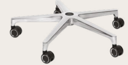
5-Star Balance Aluminium Base - 60mm Chrome Trim Castors