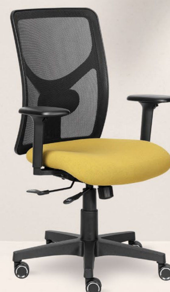
Y-Not Up-Spec New Cushy 2-D Arms with PU Armpads Chrome Trim Castors - 60mm Econo + Mechanism with 2 position Lock & Seat Slider Moulded Foam Seat