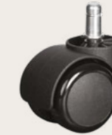
50mm PU Castors