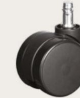
60mm Nylon Castors