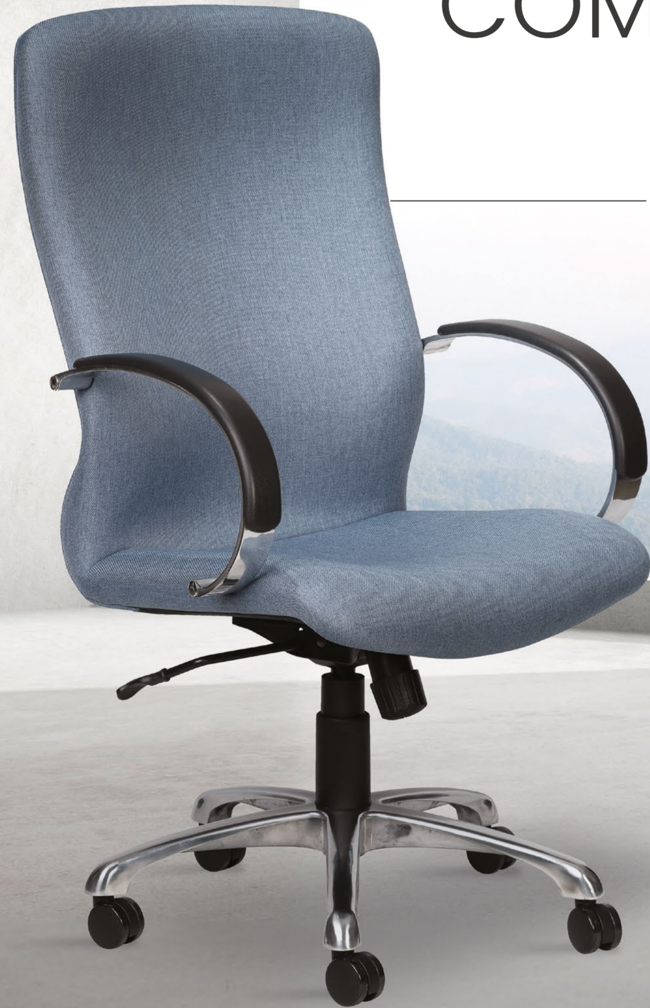
HULK - NEW Standard