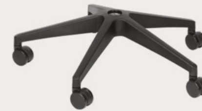
5-Star Nylon Spider Base - 60mm Castors