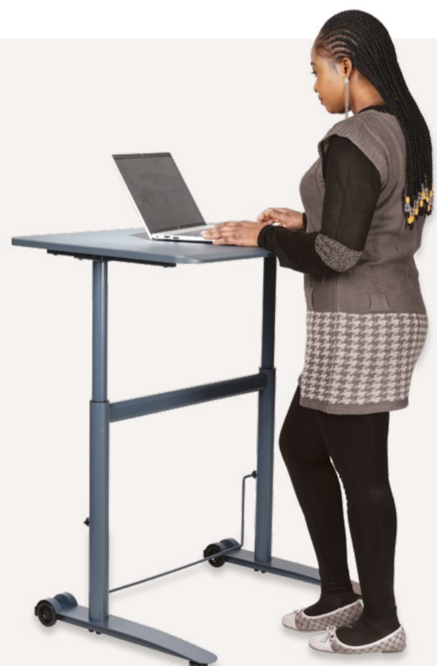
LIFT SIT STAND WORKSTATION - NEW Top Included