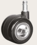
60mm PU Chrome Hollow Castors