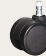
60mm PU Castors