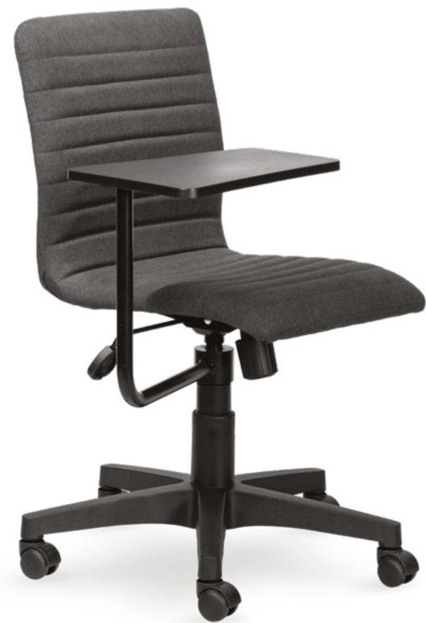
UNIVERSAL WRITING TABLET