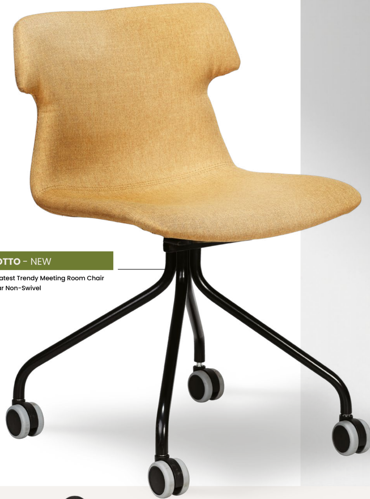
MOTTO - NEW Our Latest Trendy Meeting Room Chair 4-Star Non-Swivel