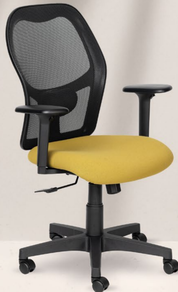
9-5 Up-Spec New Cushy 2-D Arms with PU Armpads Moulded Foam Seat