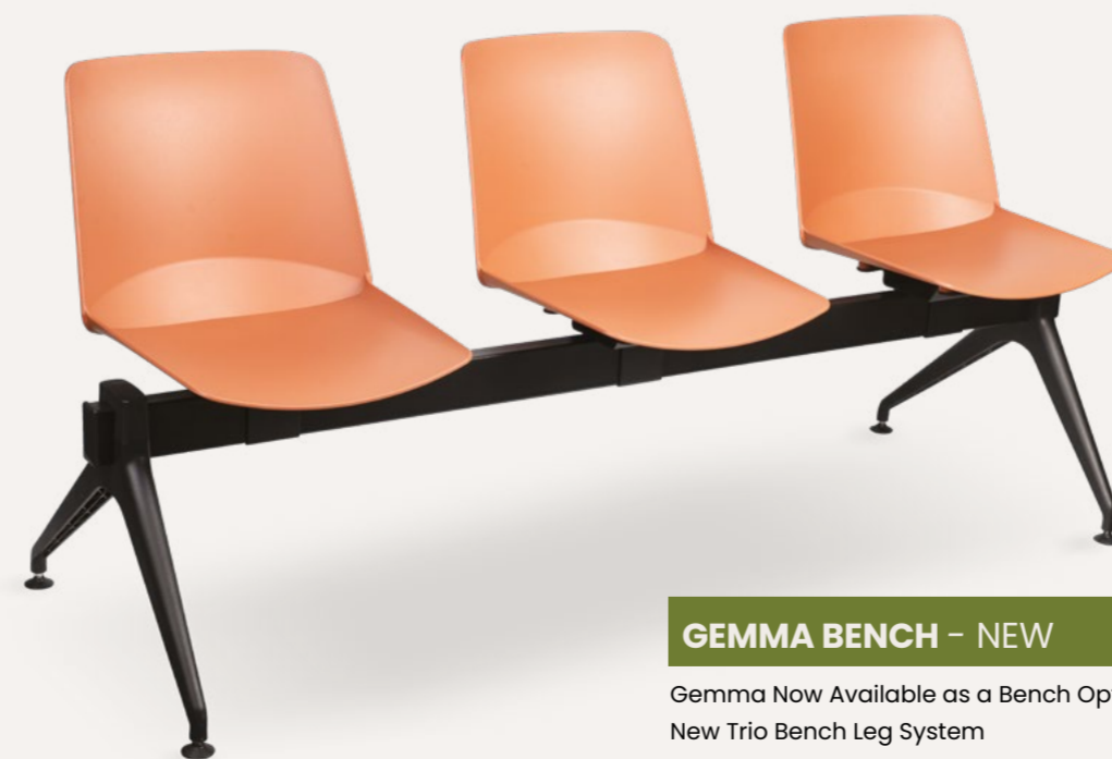
GEMMA BENCH - NEW Gemma Now Available as a Bench Option New Trio Bench Leg System