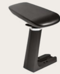
3D with Chrome Trim Height Adjustable Arms PU Armpads