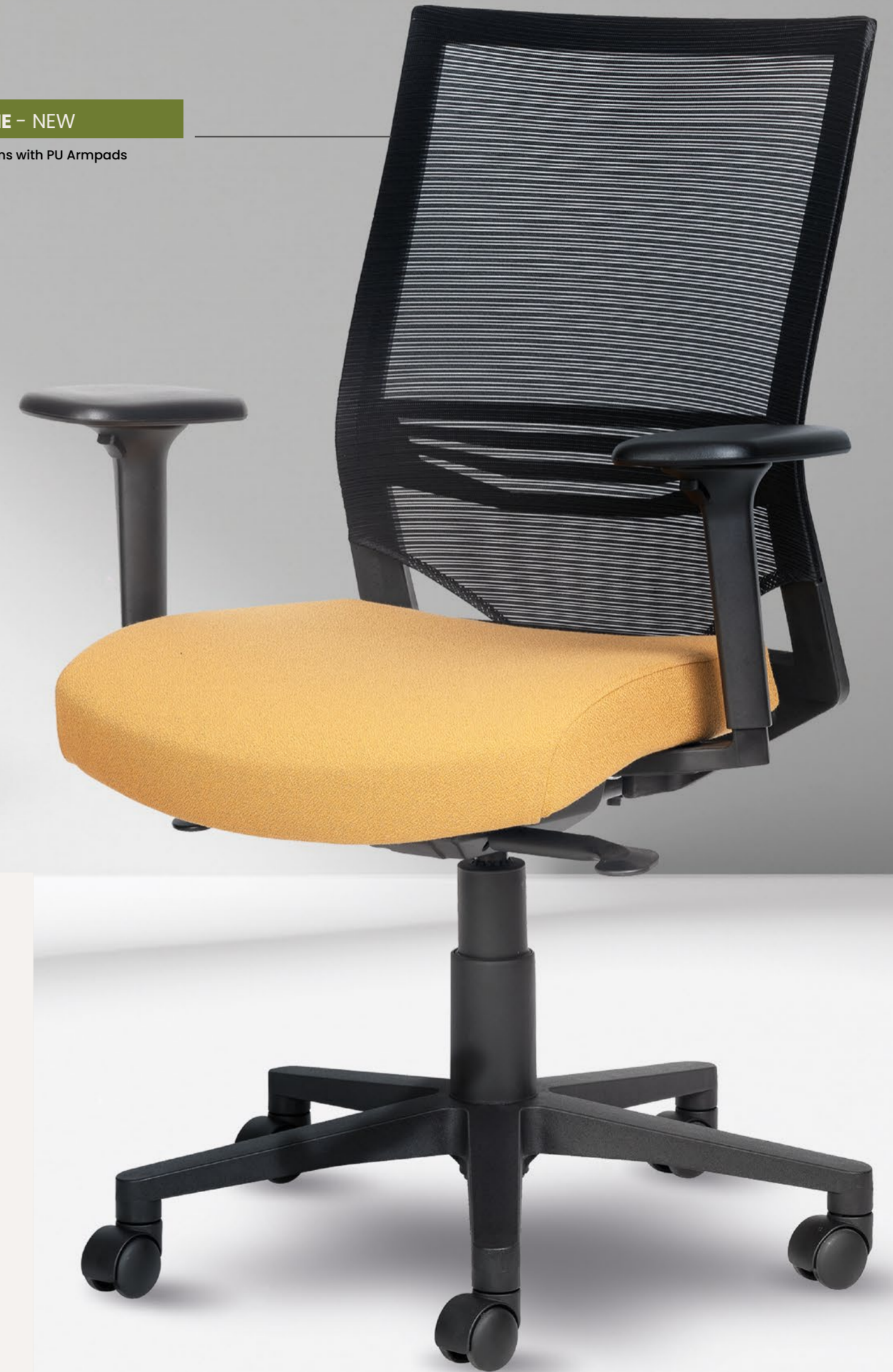
FINE-LINE - NEW Cushy 2D Arms with PU Armpads