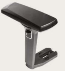
4D with Chrome Trim Height Adjustable Arms PU Armpads